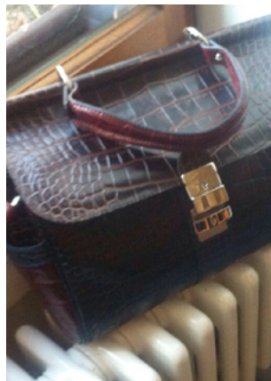
Anne can no longer read or spot typographical errors in the « Recherche » in the Pleiade edition.