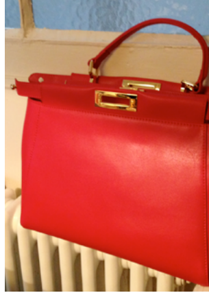
Isabelle is going on holiday in Greece.